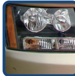
Headlight Yellowing (included with RV+)