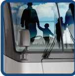
Loss of Gloss