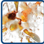
Bugs and Insects